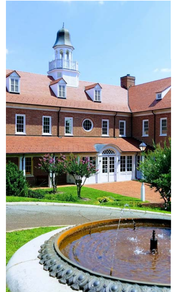
The Archie K. Davis Center, home of the Moravian Archives and the Moravian Music Foundation, in Winston-Salem, NC

Parking is in the northwest corner of the lot at the western end of SR 4326 (Rams Drive) off Salem Avenue. The same street serves as entry to the Elbertson Fine Arts Center at Salem College.